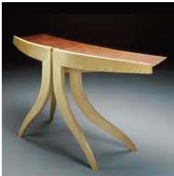
Writing Desk, 1996