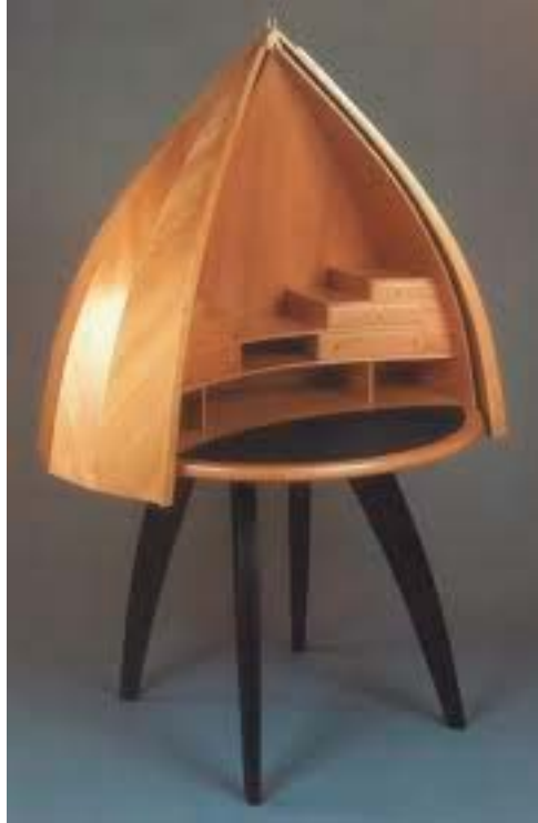
Spring Desk, 2007

626 Abbot Hill Road Wilton, NH 03086 603-654-2960 jerewood@aol.com