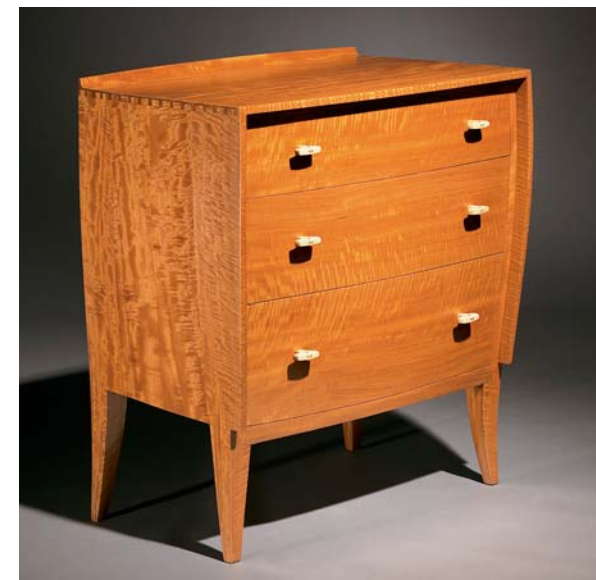
Spring Chest, 2004