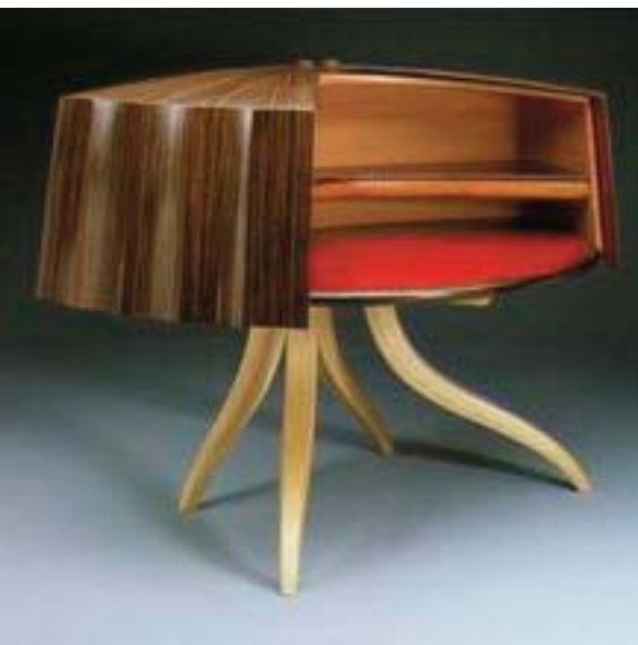
Ebony Desk, 1990